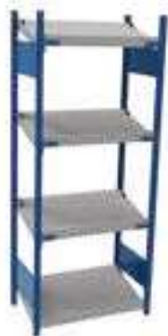
SRK1F-DC750401 Standalone Unit