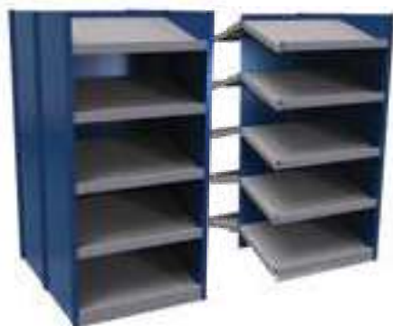
SRE2T-EE751001B Starter unit