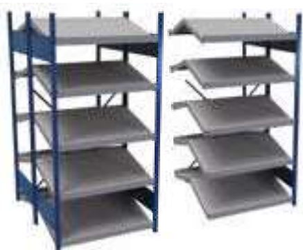
SRE1T-EE751001B Starter unit