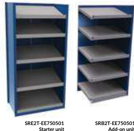
SRE2T-EE750501 Starter unit