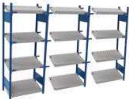
SRE1F-DC75041 Starter unit SRB1F-DC750401 Add-on unit SRG1F-DC750401 End unit