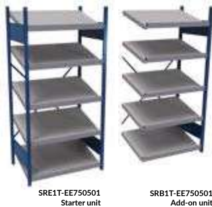
SRE1T-EE750501 Starter unit