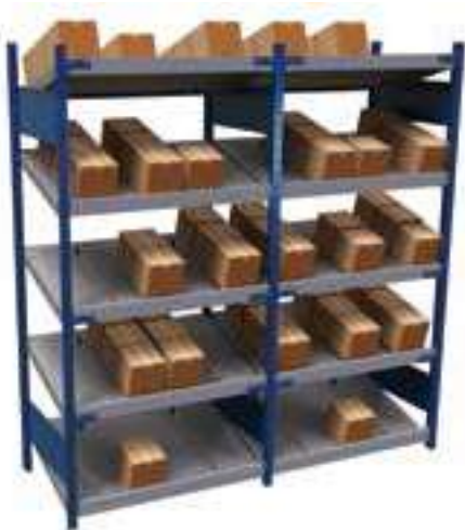
SRE1F-EE750501 + SRG1F-EE750501

Rousseau shelving with sloped shelves provides superior-quality gravity flow storage that integrates perfectly with other products in our Spider® range. This unique product on the market is available in a wide range of dimensions to fulfill your exact requirements. With an average slope of 15 degrees, sloped shelves are perfect for rear-loading applications (flow rack). These units help to create a "first in, first out" (FIFO) system. Shelving units without rear access are also available for more conventional storage. Sloped shelves provide optimum visibility for items stored on shelves above the user's eye level. For shelves below this level, the extra angle reduces visibility of the shelf contents. If visibility is more important than flow in your system, we recommend installing lower shelves at right angles (SH20 / 21).