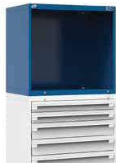
R2V Housing for Two Users (RL29)