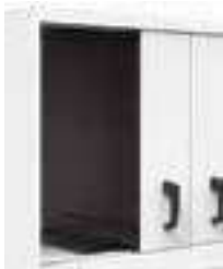
Security Panel (RL91)