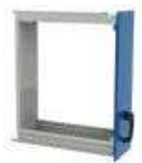
Vertical Drawer (RL31)