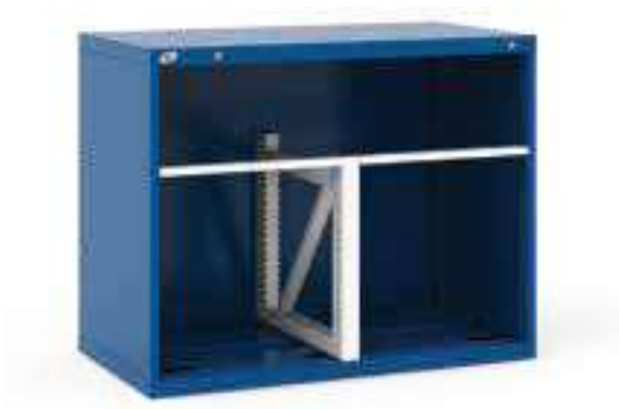
Multi-Drawer Housing for Two Users (RA34, RA45 + RA46)